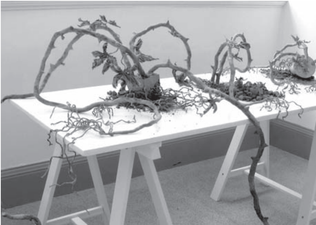
Left and below: alumnae work on display as part of Effuse