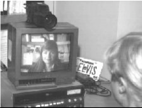
Figure 1: A typical media space node

Observational studies of naturally-occurring collaboration suggest that many of the subtle interactions involved in successful shared work are disrupted by the limitations of these kinds of views. Workers in control rooms and architectural practices, for instance, perform much of their work without explicit face-to-face communication [11]. Instead they modify their speech and gestures to provide and acknowledge information, revealing considerable peripheral sensitivity to their colleagues' activities. The limited views provided by typical media spaces disrupt these ways of working [9]. Collaborators in media spaces are often frustrated by their inability to show each other artifacts such as paper or screen-based documents [see also 4]. Moreover, many of the actions performed via nonverbal behaviour seem to lose their interactional significance when conducted through a media space. In sum, current media spaces fail to support peripheral monitoring and involvement in collaborative tasks.