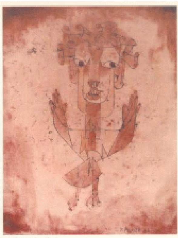
'Angelus Novus' by Paul Klee

Walter Benjamin commented famously that Paul Klee’s painting ‘Angelus Novus’ could be viewed as a metaphor for history. Here ‘progress’ corresponded to something close to an anarchic piling up of human debris at the feet of the Angel. His powerful image looms as New Labour preens itself after another landslide elec-