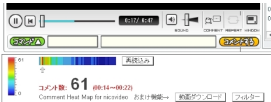
The first script of Noriaki-san: Heat map (image by Noriaki-san)

lot of comments. Blue: Very little comments. It also allows you to download the videos with one click.