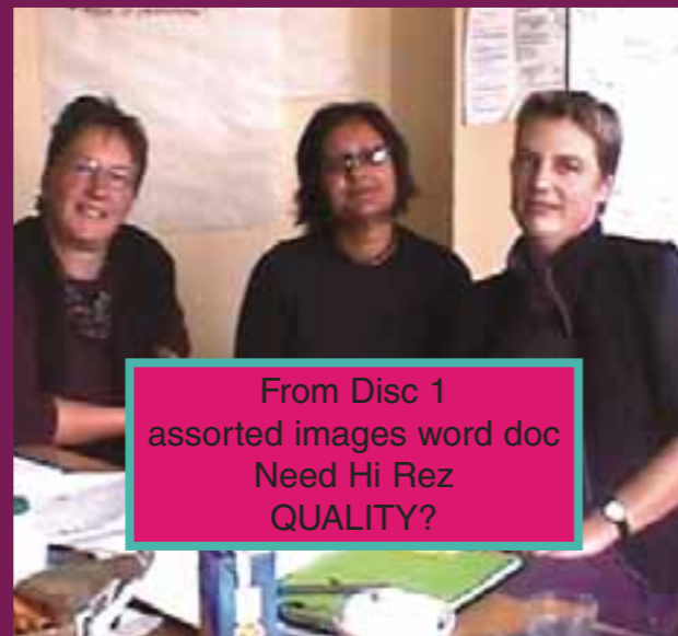
From Disc 1 assorted images word doc Need Hi Rez QUALITY?

The West Midlands hub has gradually and methodically engaged women and their families in effective community organising and increasing their ability and confidence to exert influence at the levels of policy and service delivery.