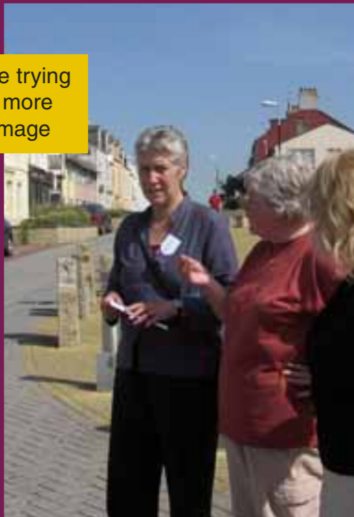
Home Office trying to source more relevant image

'I have a wider outlook than before – from seeing other people at work. Because I have been out of work for so long it has made me think that one day I may be able to get back into work full time and I would now have the confidence to go for a good management position – using my skills, whereas previously I had thought I would only be able to go for a basic clerk job.'