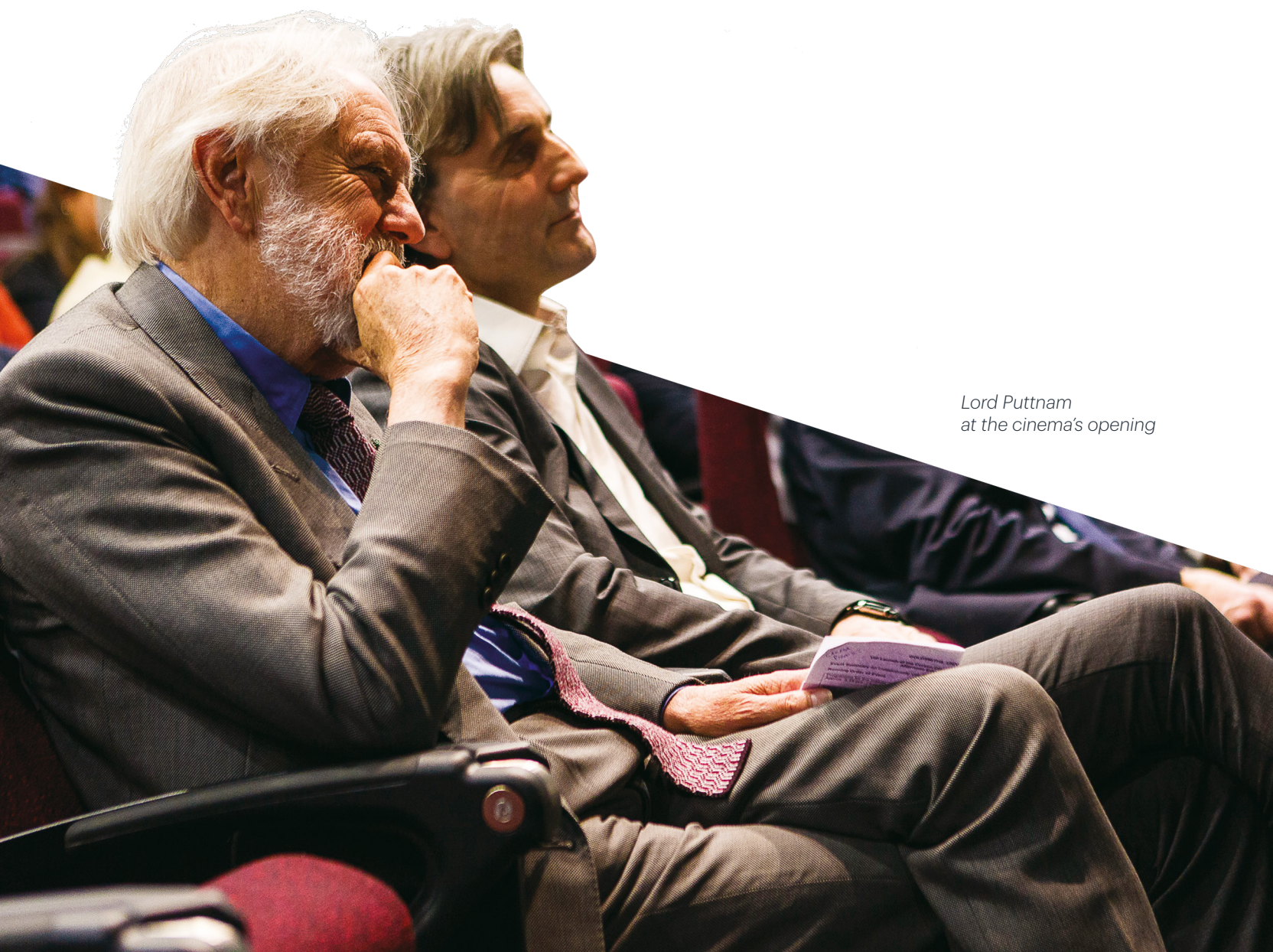
Lord Puttnam at the cinema’s opening