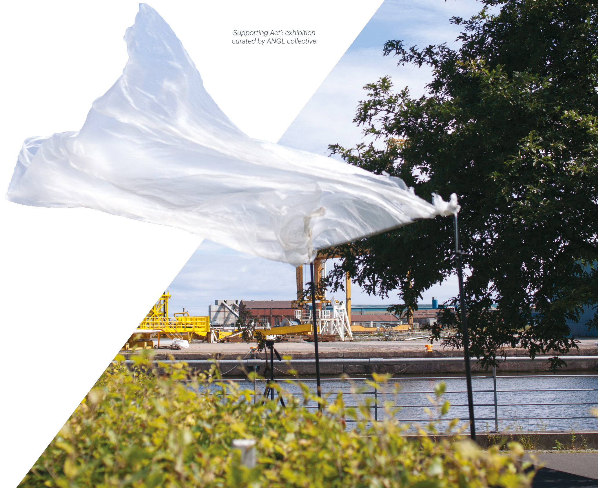
'Supporting Act': exhibition curated by ANGL collective.

The next Annual Fund telephone campaign will take place from 27 February to 19 March 2017. See pages 36 to 39 for a list of all of our alumni and friends who have made a gift to Goldsmiths this year.