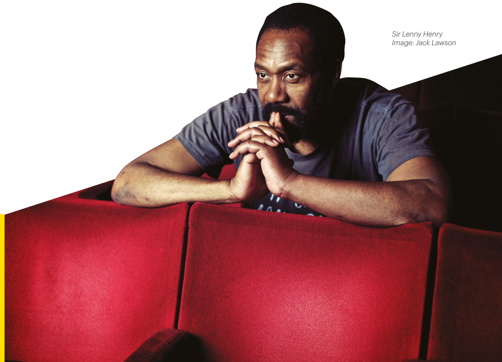
Sir Lenny Henry

The research received widespread media coverage – and was submitted to Government as part of the consultation ahead of the reissuing of the BBC Charter in early 2017.