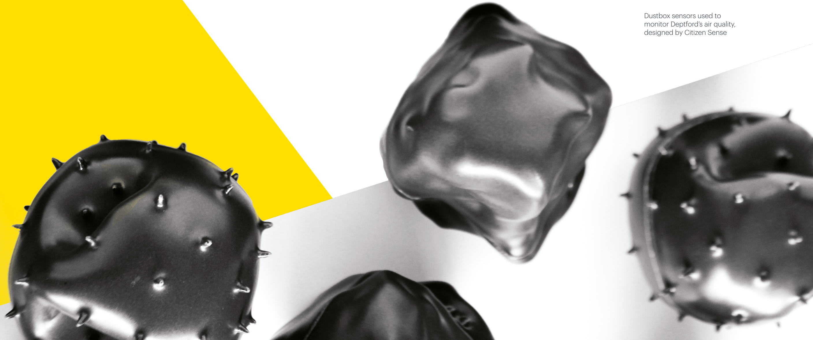
Dustbox sensors used to monitor Deptford's air quality, designed by Citizen Sense