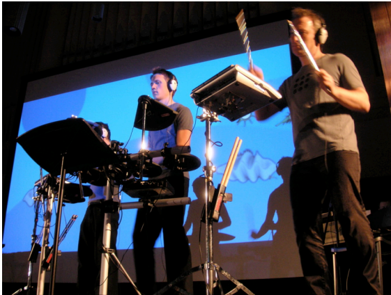
The Sancho Plan control a cast of animated characters

Future of Sound / Future of Light brings together an international collective of vanguard artists, musicians, animators and digital masters to unveil cutting edge immersive audio visual innovations at the Great Hall, Goldsmiths, 24 March , hosted by Martyn Ware , electronic pioneer and founder of Human League and Heaven 17 .