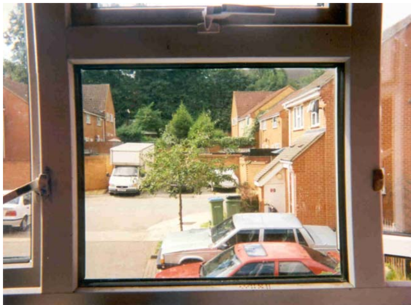
Figure 1 View of part of Hawksmoor Close from an upstairs window.

The areas addressed in the Sport Inquiry are in Plumstead and Woolwich in the London Borough of Greenwich. This is a green area of the city, on the cusp between the inner and the outer city. Close to Plumstead and Woolwich is Plumstead Common which has sports pitches, fitness courses, basketball courts, tennis courts and an adventure playground. There are a wide range of sport and leisure facilities in the area. The Woolwich Waterfront Leisure Centre has a range of sport facilities such as swimming, squash courts, gym, indoor football pitches, a soft play area for small children and a wide range of fitness programmes. Close to the leisure centre there is a recently developed skate park. Further east in Plumstead Town Centre is Plumstead Leisure Centre which also hosts a range of activities such as roller-skating and trampolining. Charlton Athletic Football Association Club is located slightly further afield in Charlton. Maps in Appendix 2 show the locations, layouts and facilities of the two estates.