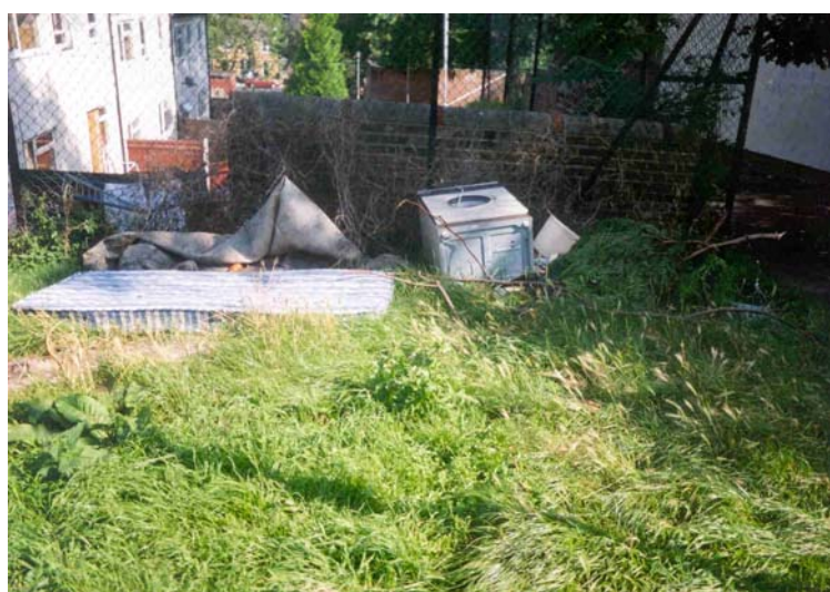
Figure 3 Photograph of Tipping on Brookhill Estate taken by boy, 11: 'There's rubbish all over the

Both estates are small, mainly made up of family homes, with a high density of children and young people. Both therefore had a history of issues around young people's behaviour. However, their problems had not previously been fully recognised, because they fall outside of the zones of priority of the key agencies and/or because their problems were obscured by the issues on neighbouring larger local authority estates. Indeed,