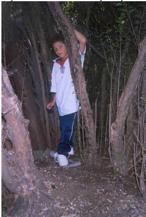
Figure 5 In the Den

In both of the areas there are clearly designated play spaces and areas where play is not allowed. On Brookhill, a young person told us 'Before, there was a sign saying "Dogs [Can't] Play On The Children's Play Area" and now it's "No Ball [Game]s".' On Hawksmoor, children play in shadow of 'No Ball Games' signs and the fear of complaints from neighbours. In both Hawksmoor and Brookhill formal youth provision is often underused, due to a combination of the factors discussed here, but informal spaces are popular and used regularly. For example, young people on Brookhill have created their own dens with dumped tyres, old furniture and bits of wood in in-between spaces on the estate (alleys) and made a small camp on nearby wood and grassland. These spaces are popular as they are felt to be semi-private, created and owned by young people. However, young people stated clearly that they use such spaces due to a lack of alternatives. 'If there were football pitches, cages and stuff then of course we wouldn't waste our time making this... We just made it because there's nothing else to do.' Sometimes the use of these spaces can cause problems for housing management and tensions between young people and others.