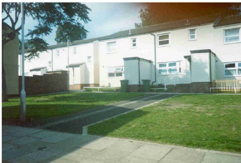
Figure 2 Brookhill Close Houses

Brookhill is in Woolwich. Housing is mostly a mix of 1950s/1960s former council housing stock and former army accommodation. Hyde housing stock mostly looks fairly rundown and poorly maintained. The estate lies within a range of other estates which are mainly managed by the local council. To the south of Brookhill across Nightingale Vale lies Woolwich Common Estate, to the south is Connaught estate, and beyond this Lord Roberts. To the west of Brookhill and Connaught estates there is some green space (patches of wood and long grass which is owned by the Ministry of Defence). Further north on the Connaught estate, there are some designated, fenced-off spaces for ball games and a skate/bike park. The Brookhill Meeting Rooms stand at the edge of the Brookhill Estate. This prefabricated building is dilapidated. It will be demolished and replaced with a new Sure Start Family centre with new shared ownership housing above to be developed by Hyde. The estate suffers from 'enviro-crimes', such as tipping and abandoned vehicles.