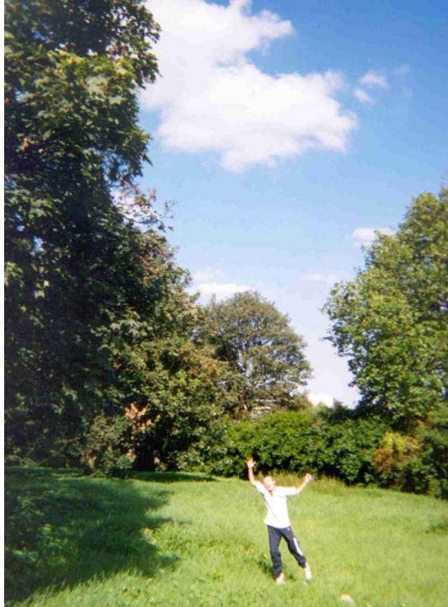
Figure 12 The MOD Land

used on an informal basis by local children and youth. In the longer term it is expected that much of the green space in the area will be sold for development which would be a considerable loss to the young people and the local residents generally. Any increase in the local population will put further pressure on the recreation facilities and spaces already available. It may be the case that Hyde together with LB Greenwich may be able to find opportunities to secure some recreational space under section 106 opportunities alongside future development opportunities. (Greenwich Draft Sports Strategy specifically mentions maximising the use of section 106 to provide sport facilities).