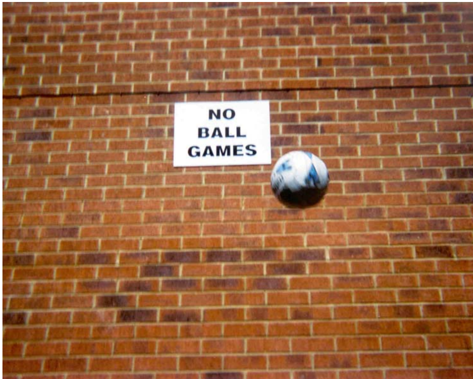
Figure 10 Brookhill Close Sign

Clearly, addressing play and sport provision on an estate level provides specific challenges for RSLs. Firstly, working on estates means dealing with residents' expectations. This often means addressing resident's jaded pessimism about the Association's commitment to bringing about change. This is often the case when past experience with agencies has been negative.