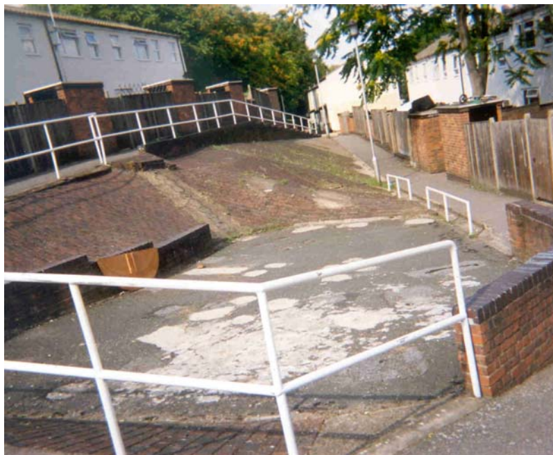
Figure 9 After play facilities were removed. "There used to be six parks but the others were demolished. They weren't safe."

The Houses on Brookhill Estate are ex-army houses which Hyde inherited through stock transfer. Much of the estate is terraced with paths linking small courtyards. There are no designated play areas on the estate but there are several small patches of green. Some of these have 'No Ball Games' signs. One of these had some play facilities such as swings for small children. This was in need of repair and was removed when the properties were taken on by Hyde. These have not been replaced. Young people play on some of these small green spaces and, as is the case at Hawksmoor, this is often the cause of friction between young people, neighbours and parents.