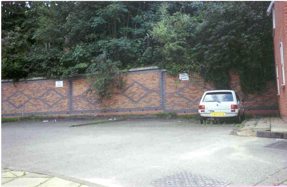
Figure 11 Car parking space adjacent to the cage