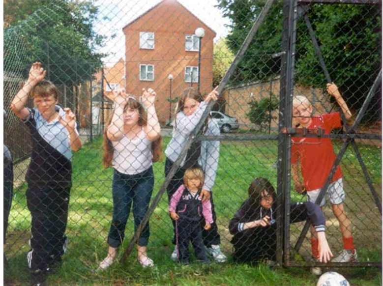
Figure 7 Participants in the 'cage'.

There are a number of obvious design issues when addressing play and sport on the estates. The Hawksmoor Estate is a series of cul-de-sacs surrounded by small modern houses. There are also two low-rise blocks of flats at the side of the estate which backs onto the edge of Plumstead Common. This area is bounded by a high brick wall. Between the blocks of flats are two parking areas and a small area which was ostensibly designed for play: This 'cage' consists of a small patch of grass surrounded by a 3 meter mesh fence which is broken and somewhat dangerous effectively restricts the playing of ball games both physically and also creates a slightly forbidding impression. The surface of the play area is grassed and is used for dog fouling.