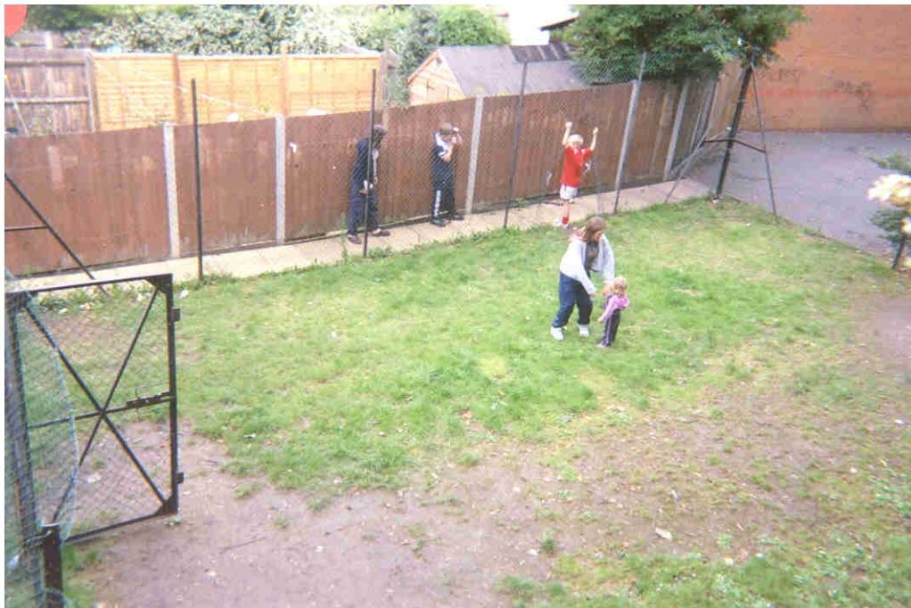
Figure 8 Hawksmoor 'cage'

Behind the blocks of flats there is a narrow alleyway which serves little purpose other than to give maintenance access to the rear of the flats. Either end of the alleyway is currently sealed by two mesh gates; these do not appear overly secure. Previous to the gates being in place the alleyway was an opportunistic hidey-hole whose use by youths had disturbed and caused concern to tenants living in the flats. The entrance to the flats consists of a covered shelter accessible by non-residents.