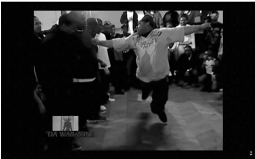
Figure 4 Dancer at Da War Zone battle.

These dual possibilities point back to my earlier arguments on the status of black hood dance. While Naomi Bragin's conceptualization of black hood dance as social thought was useful as a starting point, her conceptualization of this type of black performance has its limits. Exposing the uncritical 'celebration discourse,' which seeks to elevate black hood dance as a simple affirmation of black life 'under conditions of disappearance and death' without ever attending to the realities of 'everyday police terror,' Bragin argues such styles exemplify the way in which black performance reconstitutes the vastness of the crime that was racial slavery without ever transforming it. 63 Black hood dance, according to Bragin, operating under