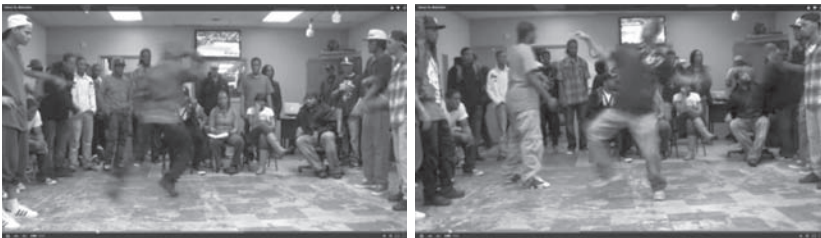
Figure 1 Dancers from Havoc (left) and Below Zero (right) compete at Battle Groundz.

Dancers make up their own routines on the floor, with their shuffling feet following the lower frequencies and their bodies popping to the claps. A good footwork