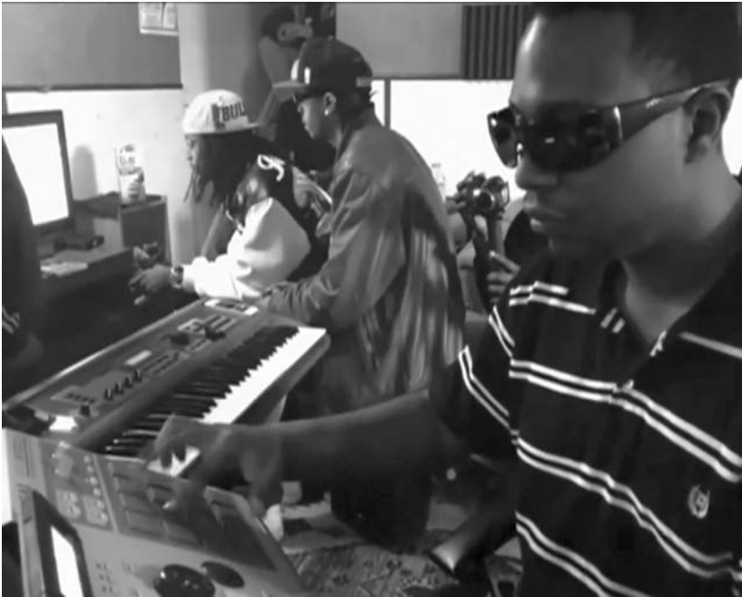
Figure 2 DJ Rashad's fingers 'dance' on the pads of an Akai MPC 2000XL as he produces a track.

The Footwork battle circle is formed within what is externally deemed to be restricted terrain. Such external constraints are the function of racial pressures that are manifested through the state and civil society's lethal political, economic, and geographic governance. These forces combine to externally designate the city's South and West sides as ghettos, and therefore render them, from an external position, as pathological. As Drake and Cayton show us, duress has never been the defining internal feature of Chicago's South side, and this certainly applies to Footwork. Operating inside the multi-dimensional function of the cordon sanitaire, the battle circle becomes the site of production for what we could call a series of