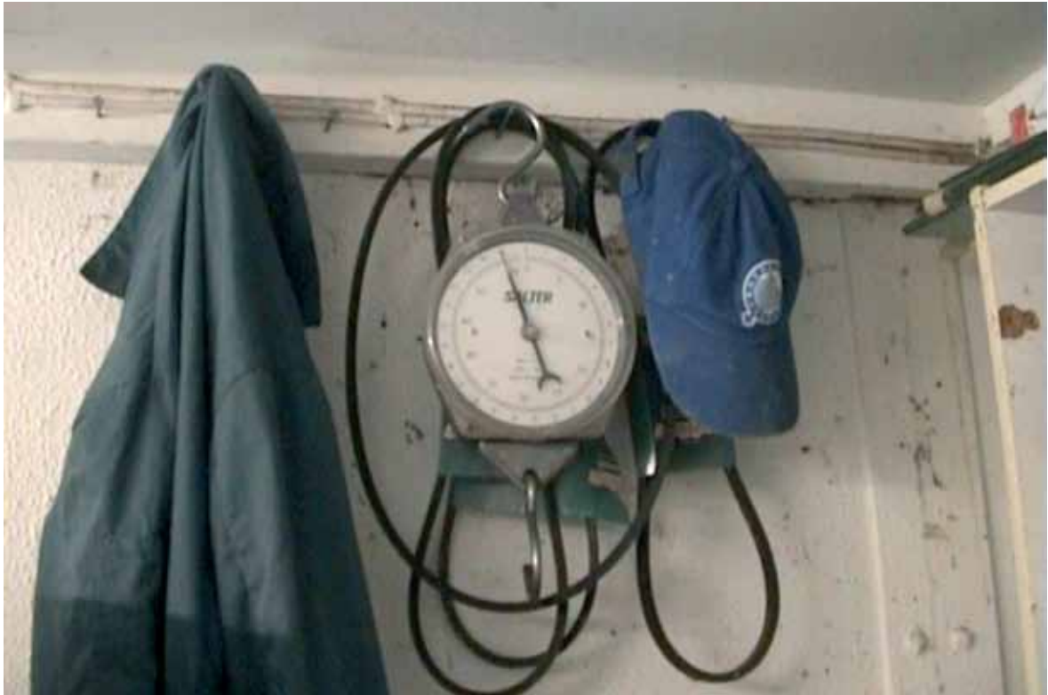
Video still: Various hooks and nails support an old-fashioned set of spring scales, three spare sets of overalls, and two baseball caps, while on an adjacent cork notice-board sheets of information concerning health and safety law, fire drill, disease precautions, and an obscene cartoon involving a man and a bear are secured by rusty drawing pins.