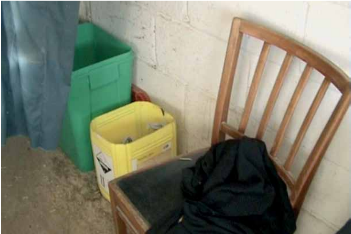
Video still: In the office most of the available floor space is taken up with bins, large cardboard cartons of supplies awaiting unpacking, and three ancient wooden dining chairs whose creaking rails are festooned with jackets, fleeces, and other warm outdoor wear.