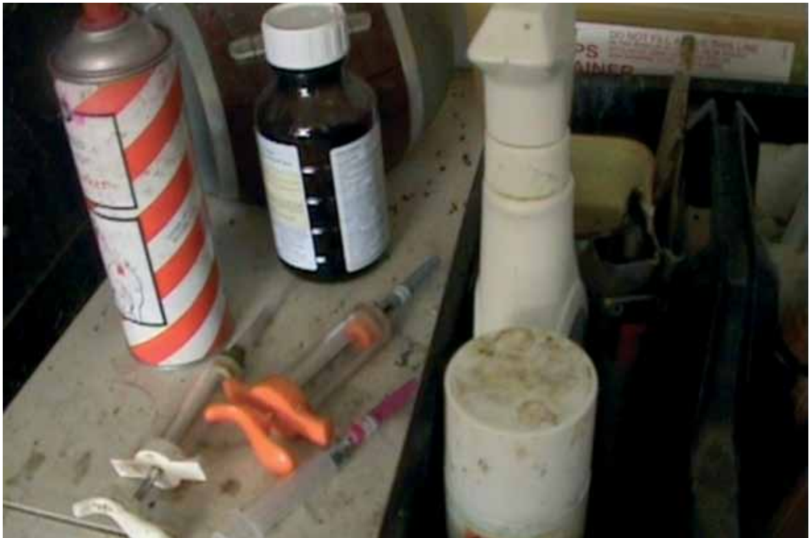
Video still: The top of the fridge is clothed in black dust and provides a convenient work surface where Brian always places his 'litter work' equipment: multi-injector, tail-docker, teeth-clippers, antiseptic navel spray, marker spray, and various other odds and ends, all kept together in a plastic tool box.