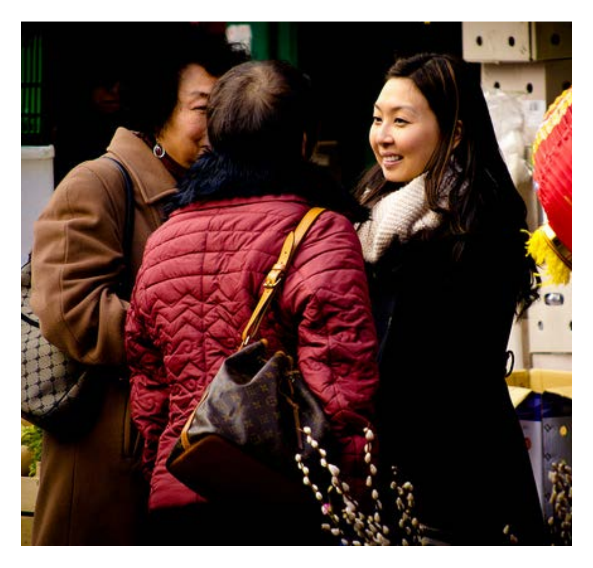
"A Chat in Chinatown"