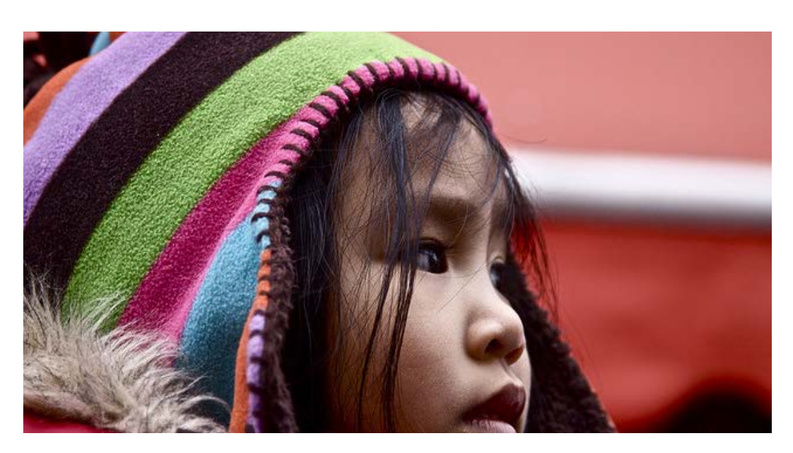
"Daydream" by slynkycat is licensed under CC BY-NC-ND 2.0

Migration extends the resilient Chinese self.